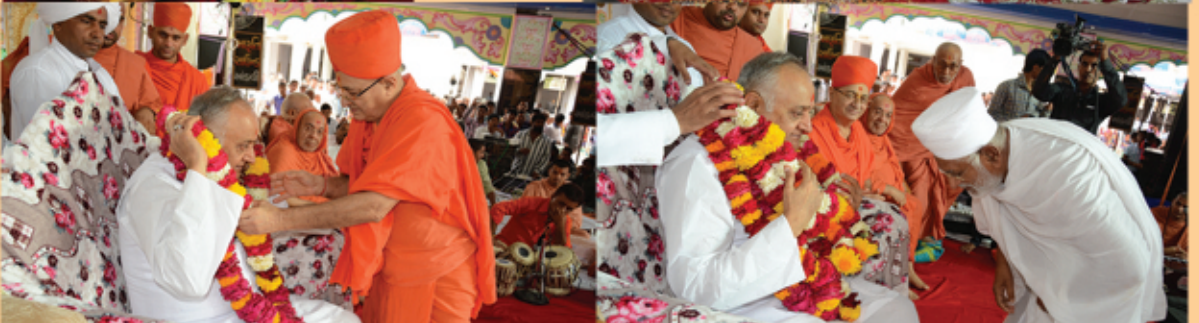
70th Prakatyotsav of H.H. Shri Mota Maharaj in Shree Swaminaryan temple, Mandvi-Kachchh